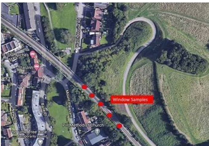
Mount Pleasant Image 3

If you are thinking about doing any work on or near the railway infrastructure, please contact us so we can provide expert advice and assistance