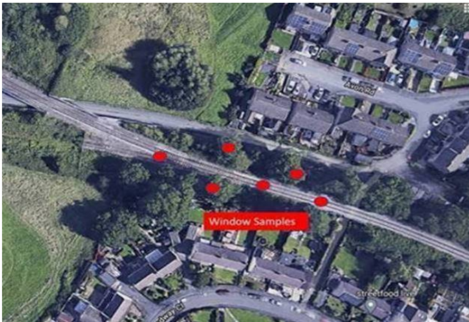
Avon Road Area Image 4

As part of these works, we need to establish a partial closure of Hardwick Road. We will write separately to local residents to advise the dates for the closure and offer the opportunity to answer any questions or concerns. During the closure we will request that the areas outlined in red below can be left clear of vehicles, so that our teams can safely carry out work.