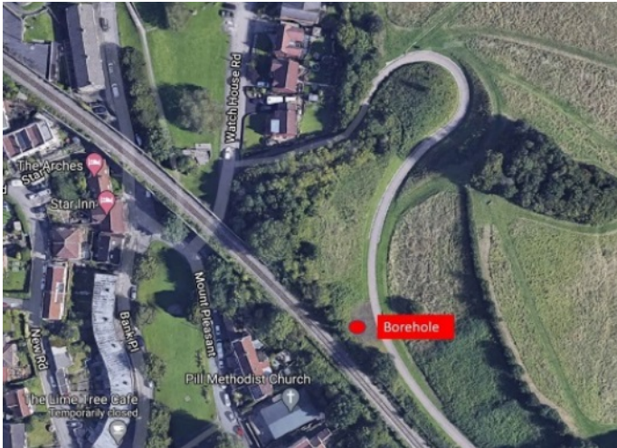
Watchhouse Hill Image 1

The red dots in the following images show where our weekday and weekend ground investigation work will take place at Watchhouse Hill (image 1) and Hardwick Road (image 2) Mount Pleasant (image 3) and Avon Road area (image 4).